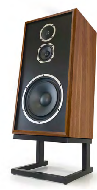
Shown in English Walnut